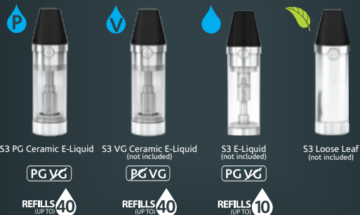
S3 PG Ceramic E-Liquid